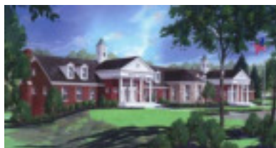
Over 50 Years of "Thoughtful Progress"