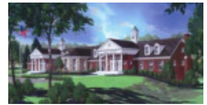
Over 50 Years of "Thoughtful Progress"

Groot Industries P.O. Box 1325 Elk Grove Village, IL 60009-1325