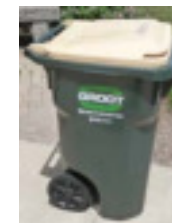
65 Gallon Recycle Cart

Recycling Carts: All residents will now be supplied with a recycling cart. While the cart must be used, you may keep the 18 gallon bin for personal use and overflow only when recycle cart is full. Place a note on the bin if you wish Groot to permanently dispose of the 18 gallon bin. Lost, damaged or stolen containers will be replaced by Groot by calling 800-244-1977. Please call Groot for more information.