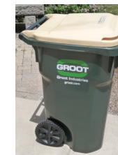
65 Gallon Recycle Cart

Recycling Carts: All residents will now be supplied with a recycling cart. While the cart must be used, you may keep the 18 gallon bin for personal use and overflow only when recycle cart is full. Place a note on the bin if you wish Groot to permanently dispose of the 18 gallon bin. Lost, damaged or stolen containers will be replaced by Groot by calling 800-244-1977. Please call Groot for more information.