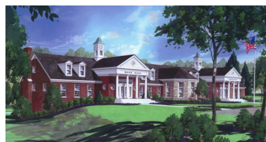
Over 50 Years of "Thoughtful Progress"