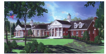
Over 50 Years of "Thoughtful Progress"

Groot Industries P.O. Box 1325 Elk Grove Village, IL 60009-1325