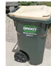
65 Gallon Recycle Cart

Recycling Carts: All residents will now be supplied with a recycling cart. While the cart must be used, you may keep the 18 gallon bin for personal use and overflow only when recycle cart is full. Place a note on the bin if you wish Groot to permanently dispose of the 18 gallon bin. Lost, damaged or stolen containers will be replaced by Groot by calling 800-244-1977. Please call Groot for more information.