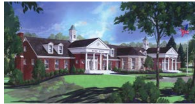
Over 50 Years of "Thoughtful Progress"