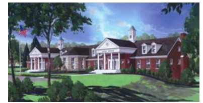
Over 50 Years of "Thoughtful Progress"

Groot Industries P.O. Box 1325 Elk Grove Village, IL 60009-1325